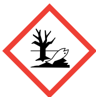
Hazardous to environment