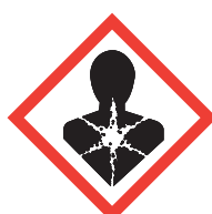
Serious health hazard