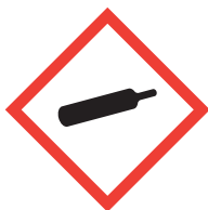
Gas under pressure